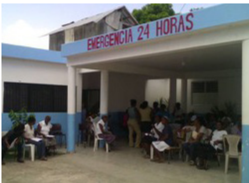
Maimón Hospital Emergency Dept