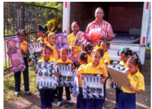
Maimón Hospital Children's Program