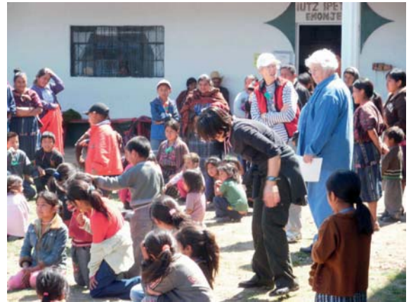
The Salud y Paz Eye Clinic in Camanchaj, Guatemala.