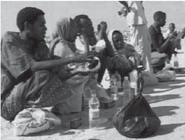
Citizens of Puntland.

migrate to the city for medical assistance. Although the southern part of Somalia is war torn and in violent and chaotic condition, Puntland, in the north, seems removed from this violence.