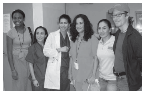
American volunteers from the DNC Foundation, Corona, NY.