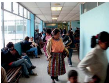
The waiting room at the San Juan de Dios Hospital.