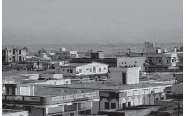
A view of Bosasso City, Puntland.

At the beginning of 2010 AMRF is preparing to ship a 40 ft container of medical equipment and supplies to a hospital in Bosasso, Puntland. Puntland is a peaceful sub-state of Somalia located on the northeast sector of the country bordering the Indian Ocean and the Gulf of Aden. Bosasso is a major city with a population of one million. Puntland has a population of about 2.4 million people, 75% of which are nomadic, herding animals for subsistence. The livestock sector dominates the economy of Puntland. Fisheries are secondary. Seventy percent of the population is below the age of 30. Many of the nomadic people