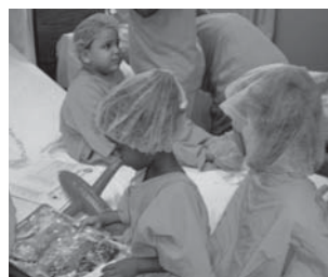
Young patients at the Juan Bosch Hospital.

The Divino Niño Child (DNC) Foundation located in Corona N. Y. is dedicated to providing medical assistance to the children and needy population of Central and South America through volunteer medical care programs. In December of 2009 the Foundation staffed and equipped a mission to the Juan Bosch Hospital in La Vega, Dominican Republic. La Vega has a population of about 450,000 people and is located in the center of the northern section of the country.