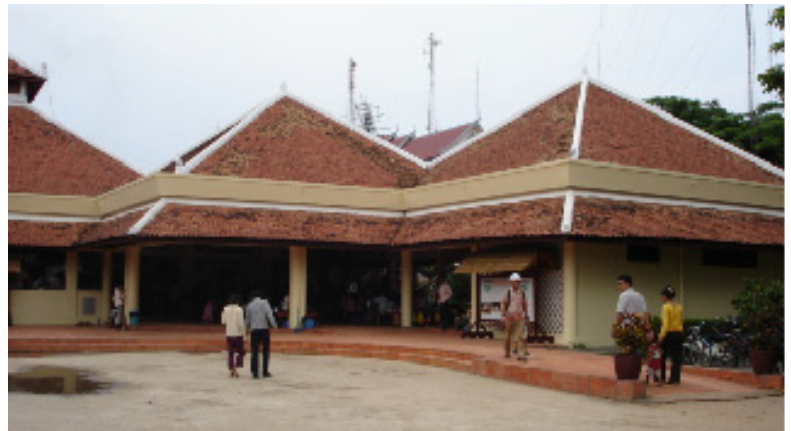
Angkor Hospital for Children in Siem Reap, Cambodia

indiscriminately provide essential and effective medical treatment and loving care to all children who seek its services.