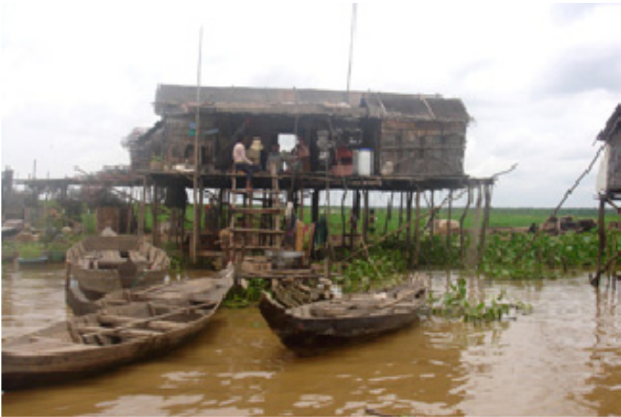
Houses raised on stilts along the adventurous route

“Then, with all my courage mustered up, it was back on the 3-person motorcycle for another 30-minute bumpy ride, a three-hour endless boat ride, crossing the two-by-four dock, and the fifteen-minute van ride to return us to the children’s hospital.