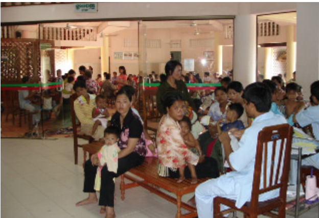
General patient waiting area at AHC

The purpose of the Angkor Hospital for Children is to