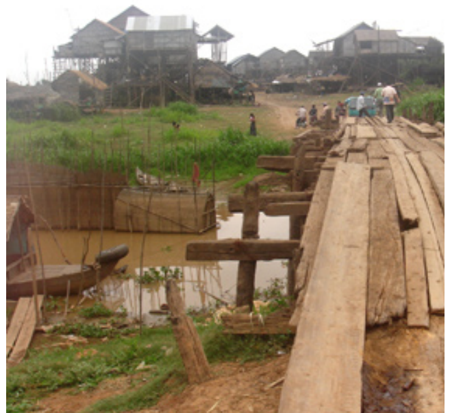
Wood planks on stilts serve as a bridge to the remote clinic. The stilts serve to raise the bridge above flood levels that occur during the rainy season

To her surprise, this was not the destination but only the beginning of Carol’s adventure. The group had to cross a ramshackle dock constructed of a series of loosely connected wood planks to board the junk boat, “hardly wide enough to accommodate my large American feet,” she joked. The boat ride lasted three long hours. They crossed a lake that seemed endless. She described the water: “brown and