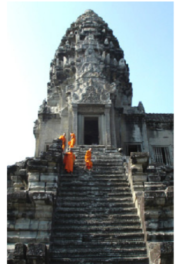
Angkor Wat Buddhist temple

ment, maintenance and repair of medical equipment including test equipment, electronic tools, spare and replacement parts and technical literature is essential for effective functioning of the hospital. AMRF is cooperating with the staff of AHC to secure funding and logistical support for the establishment of the training institute.